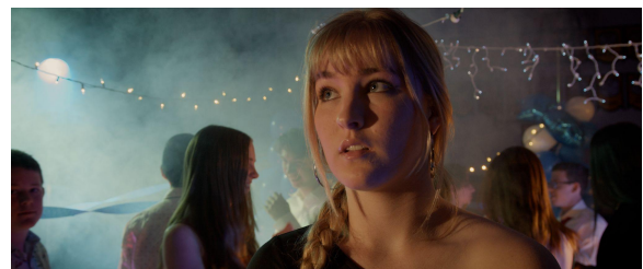
"It's Like Rocket Science" (2022)