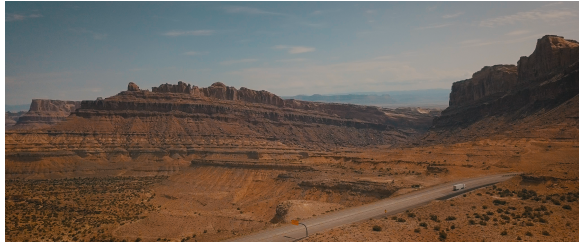
“The World Resumed” (2021)