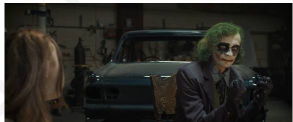
“Batman Support Group” (2021)