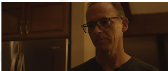
"Familiar Silhouettes" (2022)