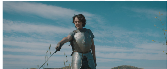
“Men of God” (2021)