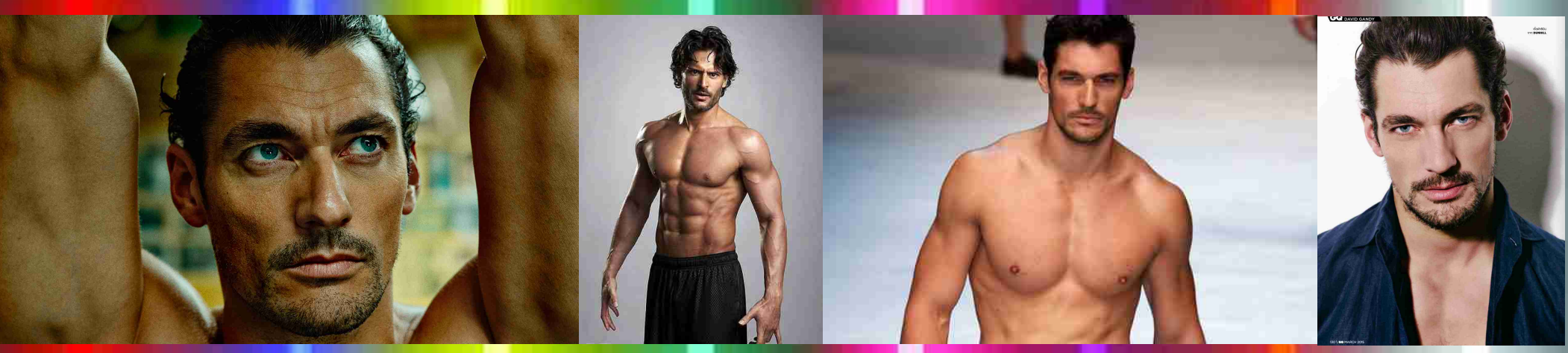
"Let's fuck! I'll fuck anything that moves!"