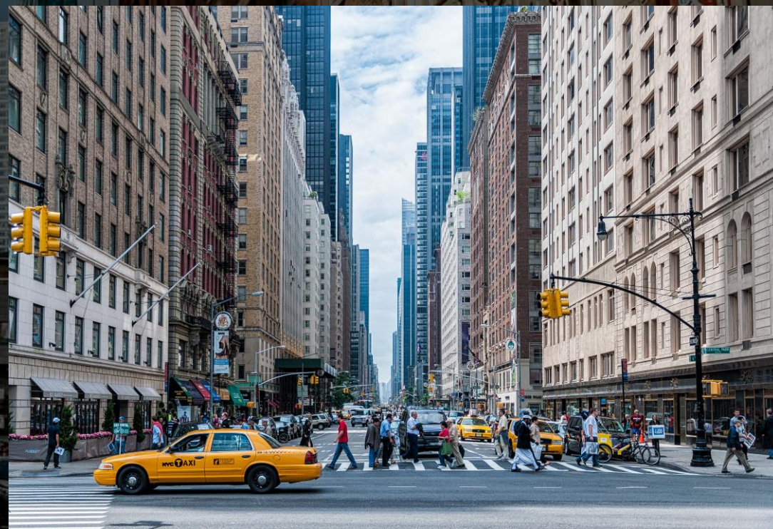
STREETS OF NEW YORK CITY