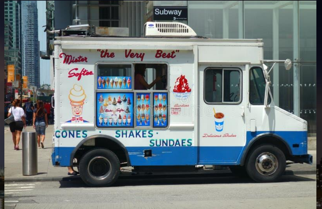
VISHNU'S ICE CREAM TRUCK